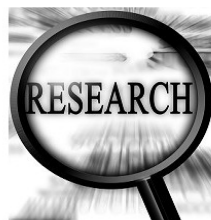
Advance Still Research Member Area