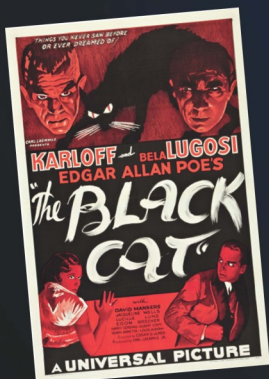
The Black Cat (Universal, 1934) One Sheet (27" X 41") Style B Realized $334,600 November 2009

Take a look at these examples and see for yourself how we realize more money for our movie poster consignors than all other auction firms combined!