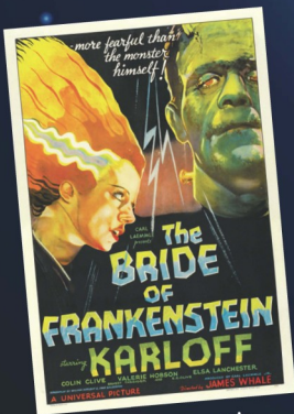
The Bride of Frankenstein (Universal, 1935). One Sheet (27" X 41") Style D. Realized: $334,600 November 2007