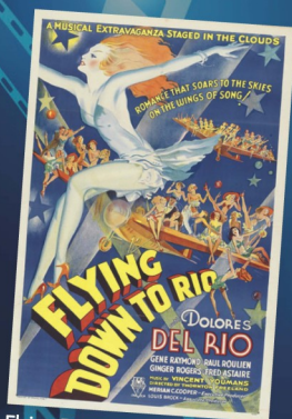
Flying Down to Rio (RKO, 1933). One Sheet (27" X 41") Realized: $239,000 November 2008

To consign to an upcoming auction, contact: